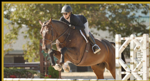
CHANDO W Pre-Green JR/AO Derby Prospect

Call Us Today To Find Your Next Champion!