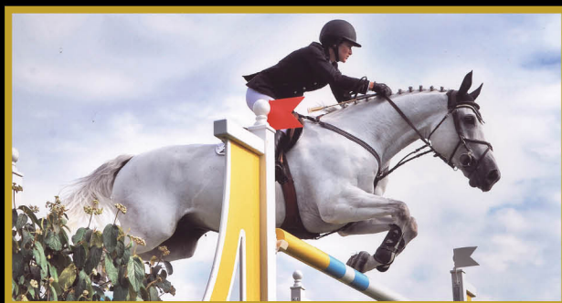
POURKOIPA FONTAINE Grand Prix JR/AO

OFFERS QUALITY HUNTERS AND JUMPERS FOR SALE OR LEASE